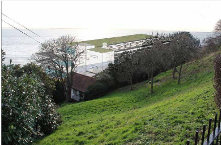
CGI from North East

Since the previous planning application, the Esplanade has changed ownership. The new owners are suggesting revised proposals for the redevelopment of the site; but proposals that account for the principles established through the previous approval. The previously approved planning application also made clear that the scale, massing and detailed design of redevelopment proposals are important for this site, given its prominent location, its proximity to the Conservation Area and the desire for a landmark development here. A high quality design is a top priority for the revised development proposal.