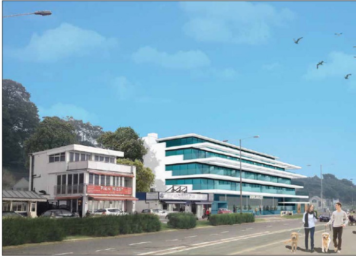
CGI from South West

Planning permission for redevelopment of the site has been previously obtained. Most recently, in April 2016 a proposal to redevelop The Esplanade into a five-story building containing flats, ground floor restaurant, and basement parking was granted planning permission by Southend-on-Sea Borough Council (Application reference 15/01842/FULM).