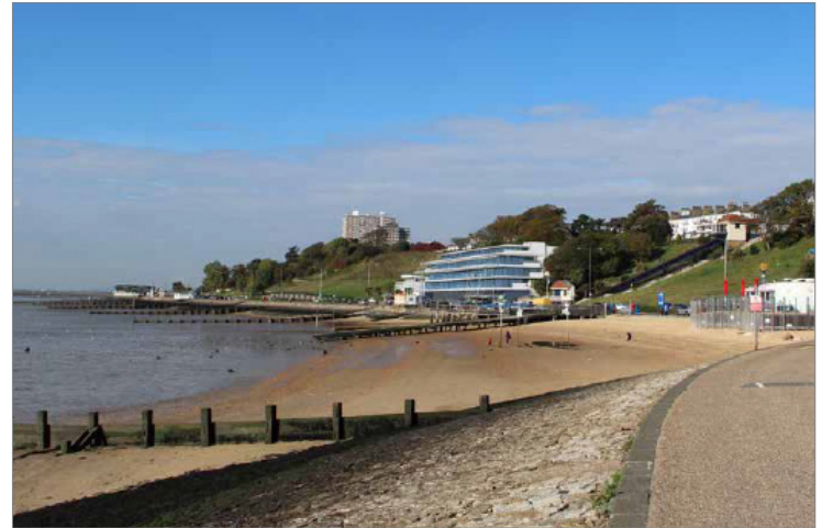
CGI from near Sands Bistro