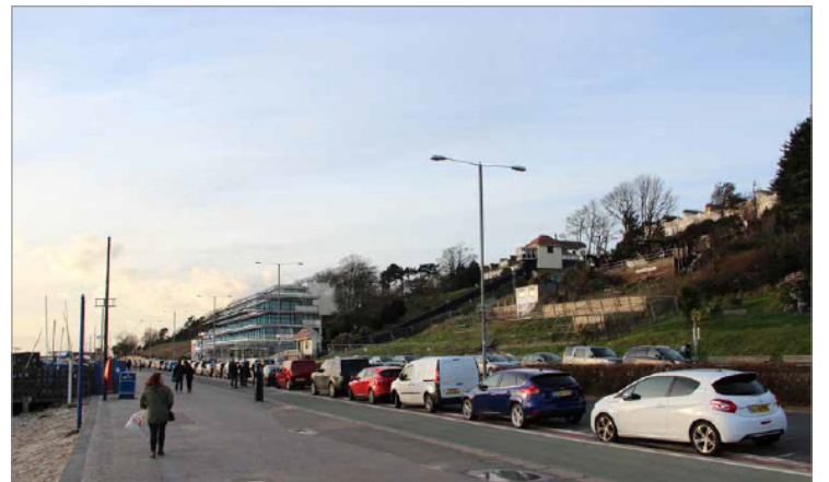
CGI from near the Three Shells café